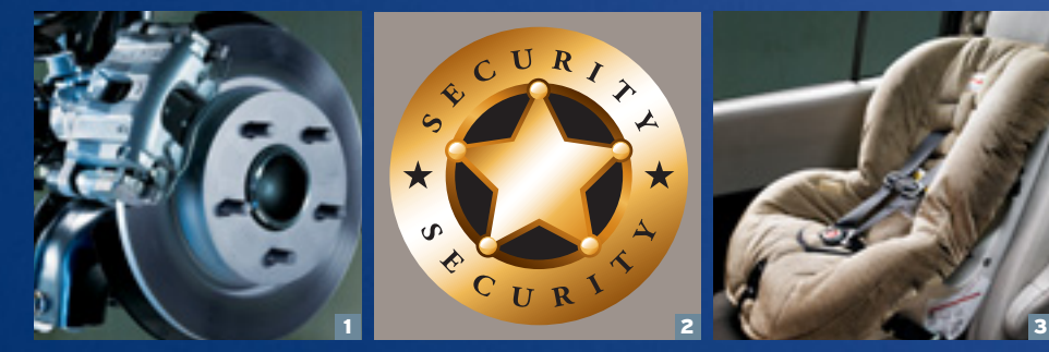
1 Power-Assisted 4-Wheel Disc Brakes With An Anti-lock Brake System (ABS) are standard on every MAZDA 5 model. Along with standard Electronic Brakeforce Distribution and Brake Assist, they help ensure linear, fade-resistant stops time after time. 2 An Antitheft System, standard on all MAZDA 5 models, helps prevent vehicle theft by immobilizing the engine. 3 LATCH Child-Safety-Seat Anchors in the second-row seats help secure your most precious passengers.

MAZDA 5 works hard at playing it safe. By now you have an idea of how versatile and fun the MAZDA 5 is. But when it comes to your safety, there's no such thing as being overprotective. That's why the 2009 MAZDA 5's many standard safety features are always on the job, adding protection from impact and injury. Some, like "Triple H" construction and steel side-impact door beams, are part of the MAZDA 5's structure. Others, like 4-wheel disc brakes with an Anti-lock Brake System (ABS) and Electronic Brakeforce Distribution (EBD), enhance driver control. And still others, including Advanced dual front air bags, dual front side-impact air bags and side-impact air curtains,* are placed throughout the MAZDA 5's cabin. All of which helped MAZDA 5 earn Five Stars—the highest possible rating—in government frontal crash tests. You'll also find three-point seat belts and adjustable headrests at all six seating positions. In fact, MAZDA 5's standard safety features even extend to a Tire-Pressure Monitoring System (TPMS) that warns you when air pressure in one or more tires is low. Proving that MAZDA 5 really does help protect you from top to bottom.