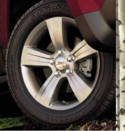
17-inch Painted Aluminum Patriot Latitude X (Standard)

PATRIOT LATITUDE X. Patriot Latitude X is very well-appointed and pleasingly fuel efficient. STANDARD: 2.4L DOHC 16V dual VVT 4-cylinder engine, antilock brake system (ABS), Electronic Stability Control (ESC), Brake Assist, all-speed traction control, Electronic Roll Mitigation (ERM), dual front and supplemental side-curtain air bags, fully independent touring-tuned suspension, driver adjustable manual lumbar, Electronic Vehicle Information Center (EVIC), 4-wheel antilock disc brakes, bright exterior accents, Sentry Key antitheft engine immobilizer, power-heated manual folding mirrors, premium leather-trimmed seats, Media Center 230, fog lamps, 17-inch cast aluminum wheels, SIRIUS Satellite Radio, leather-wrapped steering wheel with speed and audio controls. AVAILABLE: Freedom Drive II active full-time 4WD with Off-Road mode, Uconnect Voice Command, Sun and Sound Group with power sunroof and nine Boston Acoustics speakers with two flip-down liftgate speakers.