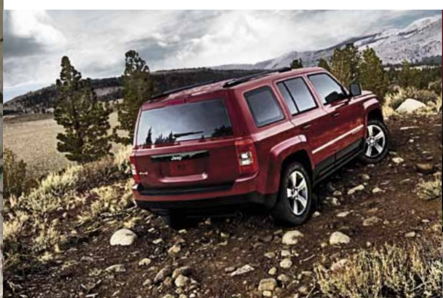
16-inch Styled Steel

PATRIOT SPORT. Begin living the Jeep life here. STANDARD: 2.0L DOHC 16V dual VVT 4-cylinder engine, 5-speed manual transmission with Hill Start Assist (HSA), antilock brake system (ABS), fog lamps, deep tinted glass, cruise control, Electronic Stability Control (ESC), Brake Assist, all-speed traction control, Electronic Roll Mitigation, dual front and supplemental side-curtain air bags, fully independent touring-tuned suspension, Sentry Key antitheft engine immobilizer, deluxe cloth-trimmed seats, Tire Pressure Monitoring warning lamp, Media Center 130 CD/MP3 radio, side roof rails, 12-volt accessory power outlet, outside temperature gauge. AVAILABLE: Freedom Drive I active full-time 4WD, Freedom Drive II active full-time 4WD with Off-Road mode, Media Center 230 with AM/FM/CD/DVD radio with auxiliary input jack, Tire and Wheel Group, front seat-mounted side air bags and Power Value Group.