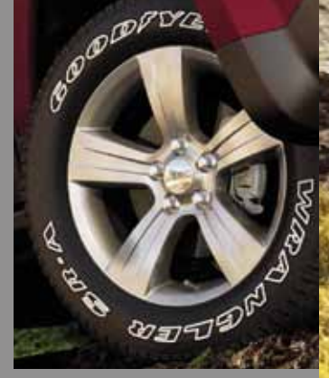
7-inch Painted Aluminum Patriot Sport (Available)