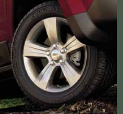
17-inch Painted Aluminum

Jeep Patriot Latitude. Explore where you will, outfitted with plenty of room to move in comfort, capability, and style. Latitude's standard powertrain includes a 158 hp 2.0L DOHC engine with Variable Valve Timing (VVT) and 5-speed manual transmission. Adventures are possible when you opt for Freedom Drive I 4WD, an all-weather 4x4 system with a selectable LOCK feature that is consistently capable. This active full-time system earns Patriot kudos for tackling snow, ice, rain, and mud like a champ.