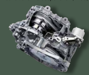
FREEDOM DRIVE I. This available, active full-time 4WD system with LOCK Mode gets you through severe all-weather conditions like deeper snow, mud, and sand.