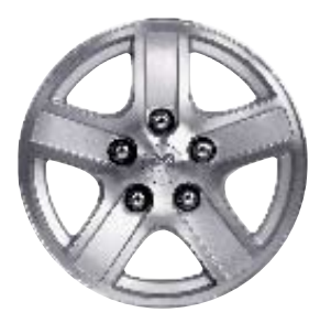
17" Painted Cast Aluminum Wheel Optional on SXT Models