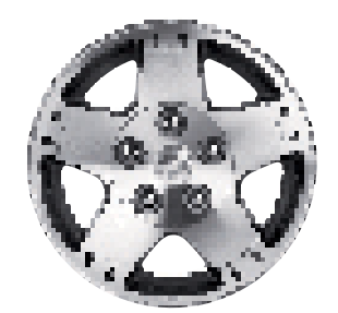
NEW 17" Machined-face Cast Aluminum Wheel Standard on Adventurer Models