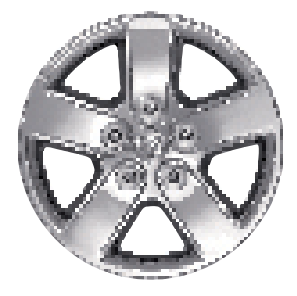
18" Chrome-clad Cast Aluminum Wheel Standard on Limited Models