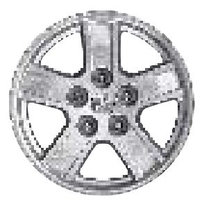
18" Cast Aluminum Wheel Standard on SLT Models