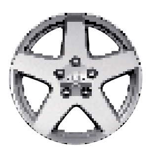
NEW 20" Chrome- clad Cast Aluminum Wheel Optional on SLT "G" and Limited Models