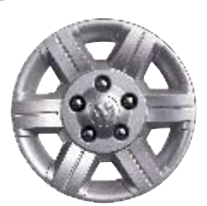
17" Styled Steel Wheel Standard on SXT Models