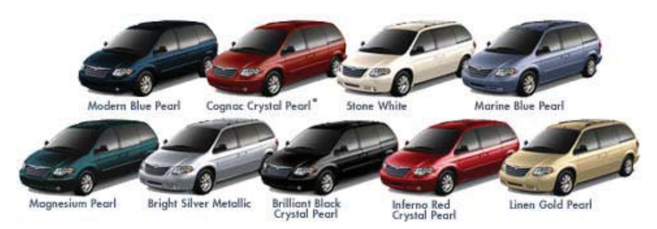
*Available on Long Wheel Base model only