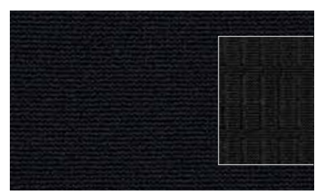
Cloth - Charcoal Black Standard on XLT