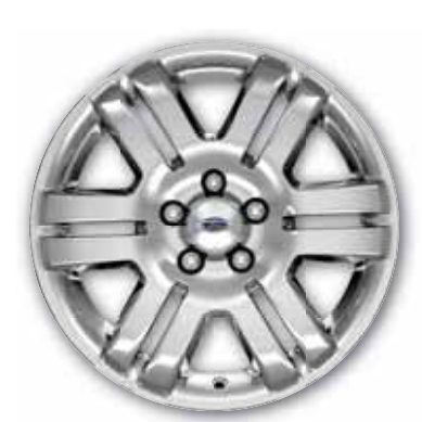
18" Chrome-Clad Aluminum Standard on Limited, Optional on Eddie Bauer