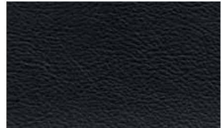
Leather – Charcoal Black Optional on XLT