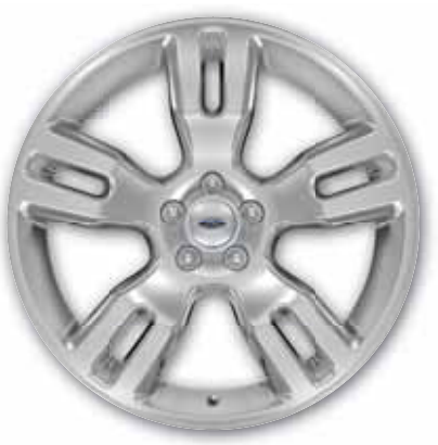
20" Polished-Aluminum Available on Limited, Included in XLT Sport Package