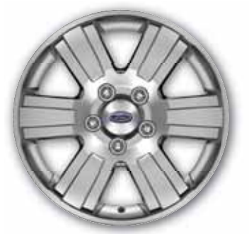
16" Painted-Aluminum Standard on XLT