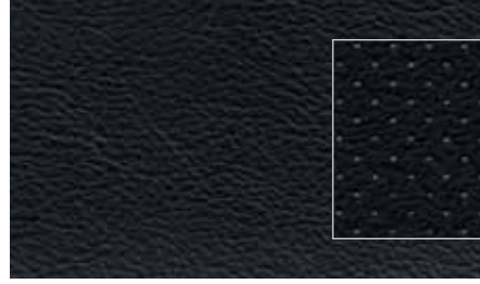
Leather – Charcoal Black with perforated inserts Standard on Limited