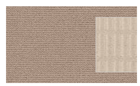
Cloth – Camel with Sand inserts Standard on XLT