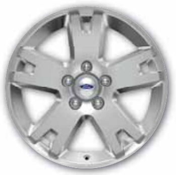
17" Machined-Aluminum Included in XLT Appearance Package