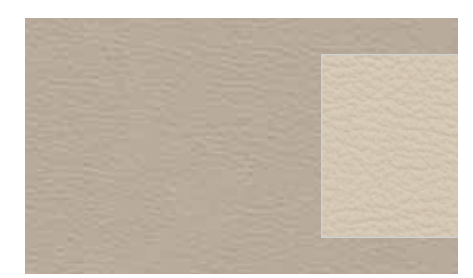
Leather – Camel with Sand inserts Standard on Eddie Bauer, Optional on XLT