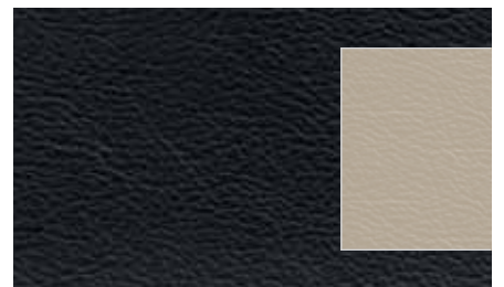
Leather – Charcoal Black with Camel inserts Standard on Eddie Bauer