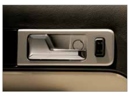
Available heated rear seats coddle passengers seated comfortably there.