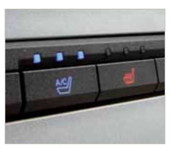
Heated and cooled front seats provide three warm and three cool settings.

The large center console of Lincoln MKX has a removable divider that allows you to customize this space for your CDs or handbag