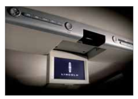
The available Rear-Seat DVD Entertainment System makes long trips seem much shorter for passengers seated in the back.