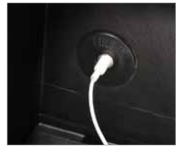
Hidden away in the center console is a power point to charge your phone and an audio input jack that allows you to plug-and-play your digital media player through the speakers.