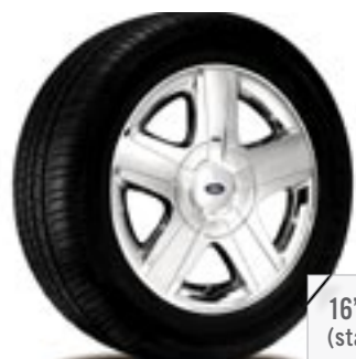
16" Chrome Clad Wheels (standard on Limited)