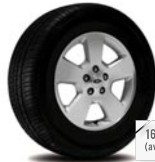
16" Painted Aluminum Wheels (available in included SE Appearance Package)