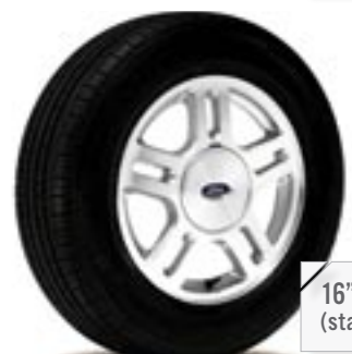
16" Machined Aluminum Wheels (standard on SEL; optional on SE)