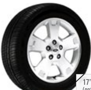
17" Alloy Wheels (optional on SEL; available with optional SE Appearance Package)