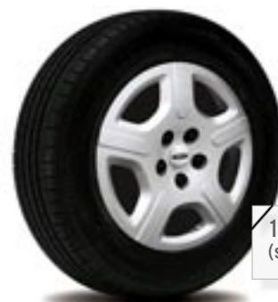
16 Steel Wheels (standard on SE)