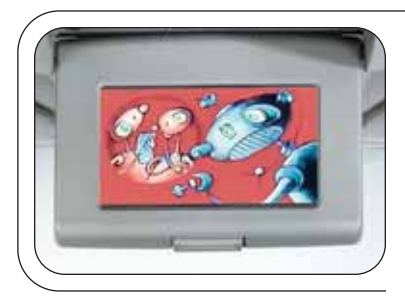
Rear-Seat DVD Entertainment System Mounted in the ceiling, this flip-down 7" color LCD screen is large enough to give even 3rd-row guests a great view. Available on Luxury and Premier, the system also includes 2 sets of wireless headphones and an infrared remote.

Premier features a 6-way power driver's seat with adjustable lumbar and memory, and a 6-way power front-passenger seat, also with adjustable lumbar. And, to top it all off, they can each be heated or cooled at the touch of a button.