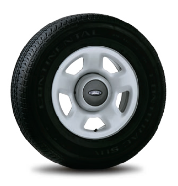
17" Painted Steel Wheel Standard on XLS