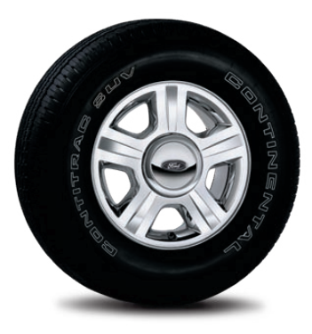
17" Chrometec™ Aluminum Wheel Standard on Limited