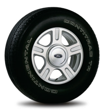
17" Machined Aluminum Wheel Standard on Eddie Bauer