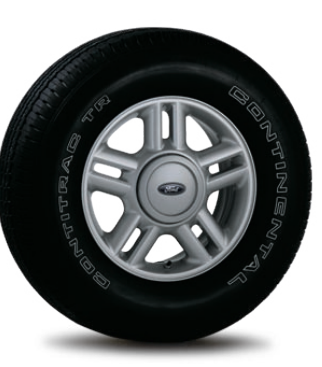
17" Aluminum Wheel Standard on XLT and XLT Sport