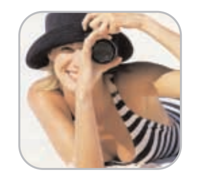
This is ZX2, and it's all fun and games.